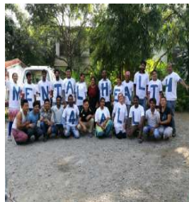
Hope Project Burans