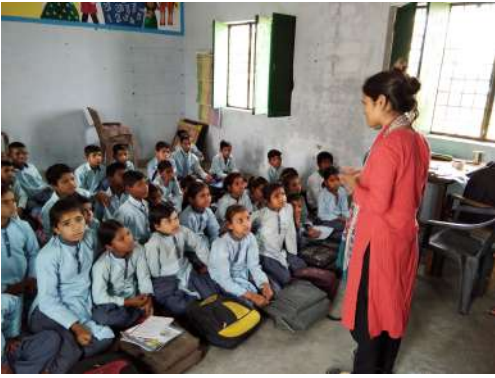
Early Intervention in collaboration with Raphael Home