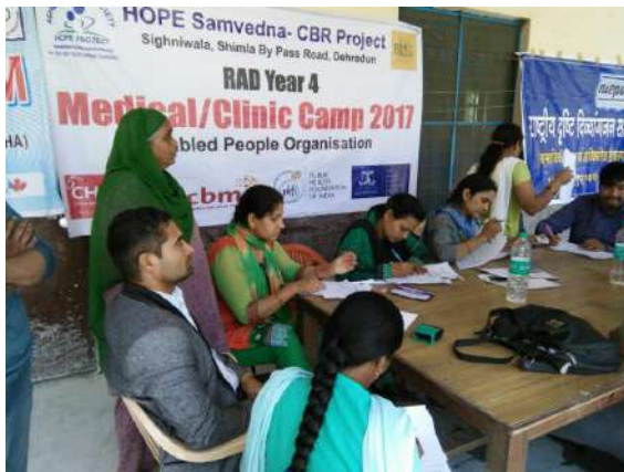
Medical Camp organized by Disabilities Peoples Group