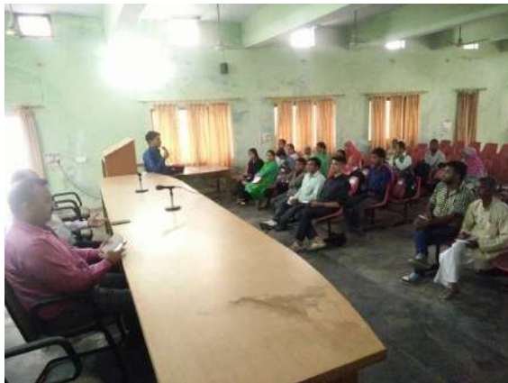
Disability Inclusive Livelihood Development Program