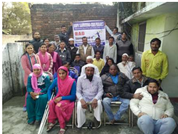
DPG Cross Learning Exposure under RAD Programme