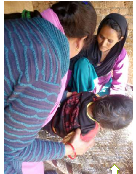
Individual Home Visits