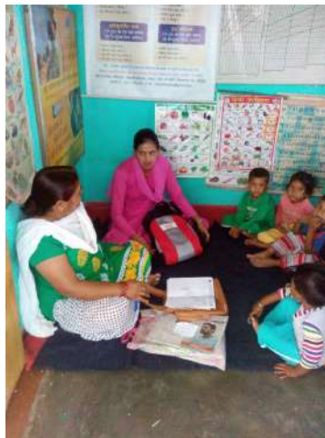
Hope Samvedna Centre