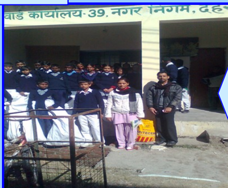
"SAY NO TO POLY-THERE" campaign