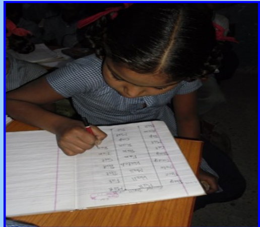
Receiving new books, bags and stationery items