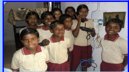
New Intercom facility