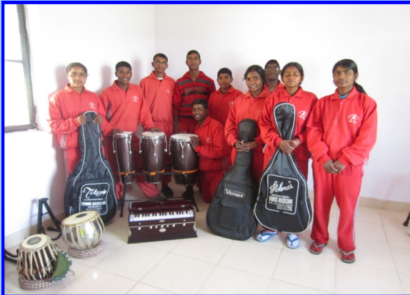
Music Class started at Hope Home