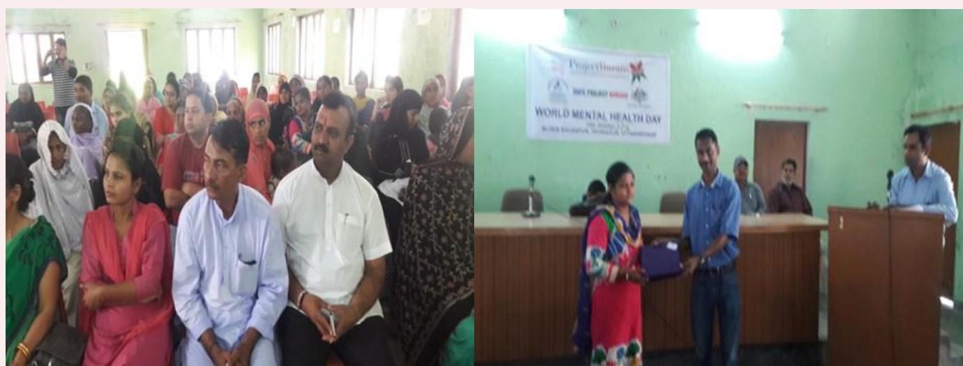
Villagers attending the sessions on Mental Health