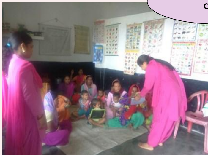
Children at Samvedna Centre

The Samvedna team has been conducting a lot of awareness meetings and programmes in the community, anganwadis and schools to sensitize people about disability, it's causes, prevention and help.