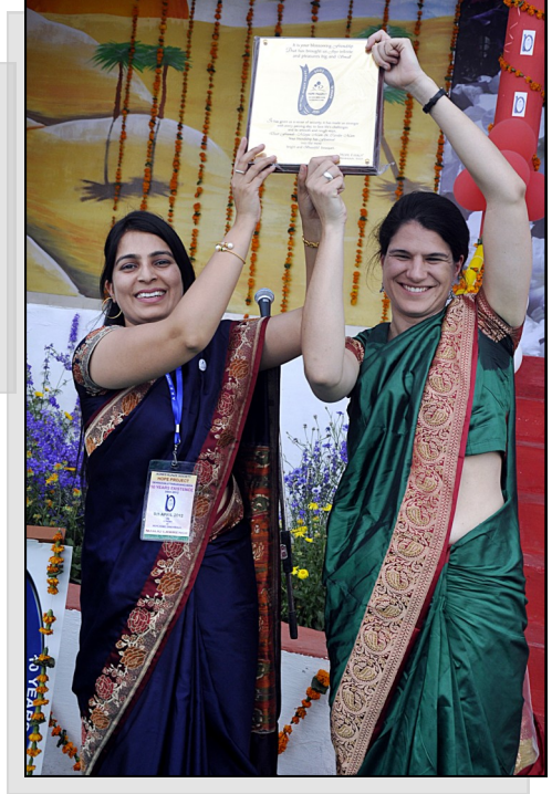
AKS 'Hope' Project operates on values of Trust, Transparency, Equality and Accountability