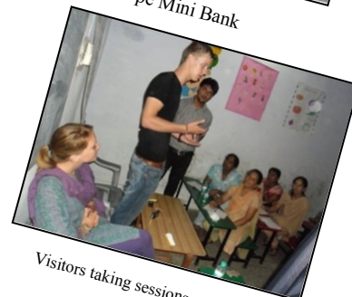
Visitors taking sessions with staff