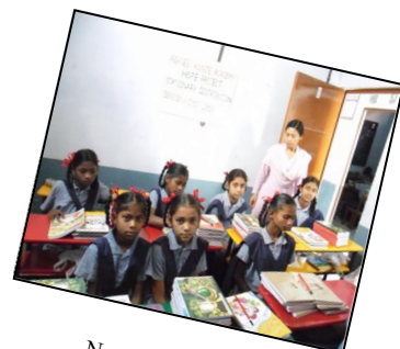
New Academic Session