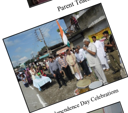
Independence Day Celebrations