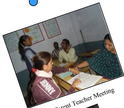
Parent Teacher Meeting

The start of a fresh academic session is always an exciting time for the children. With new books, stationery, uniforms, a new class, and a big smile, a total of 172 children were enrolled in the new session, which began in April 2012. The school is growing every year and children are very eager to come and learn. The children are provided with mid day meals.