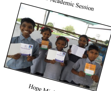
Hope Mini Bank