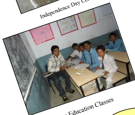
Higher Education Classes