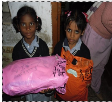
Children receiving gifts

Parents are kept informed about the progress of their child through regular parent-teacher meetings.