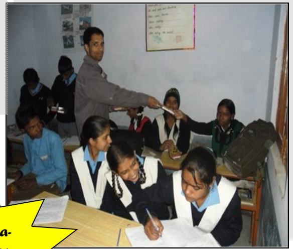
New Academic Session

Education is about creativity, learning, overall development and action.